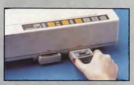
Typefaces in cartridges slip neatly into the front of the machine.