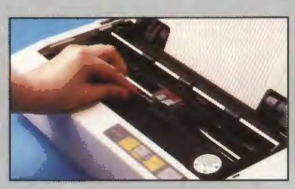
The new ribbon cassette is simple to insert – no more inky fingers!