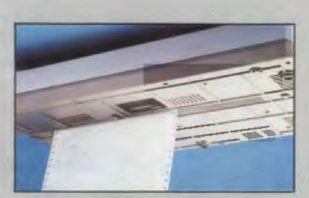
Bottom paper feed saves space and keeps the paper tidy.