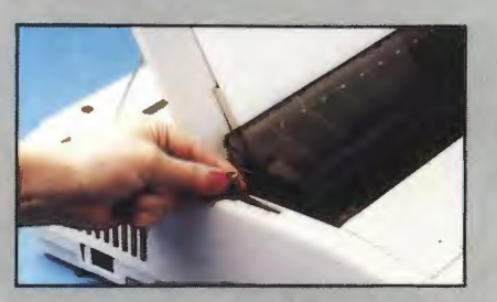
Automatic single-sheet paper feed.