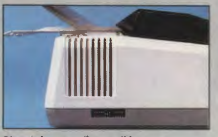
Dip switches are easily accessible.