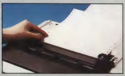
On the Star NL-10 a fully adjustable, rear mounted tractor is standard.